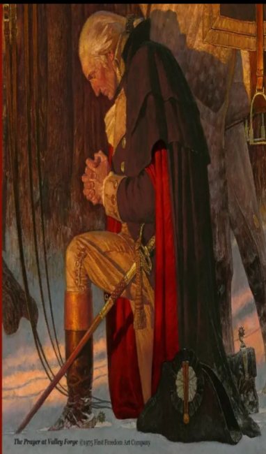
The Prayer at Valley Forge by J. M. W. Turner

NATIONAL DAY OF PRAYER IN DELTA THURSDAY, MAY 7TH @ NOON DELTA COUNTY COURTHOUSE